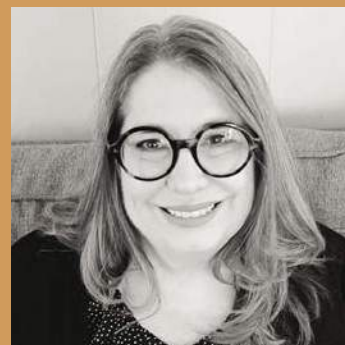
Allisha Speed Prayer Team